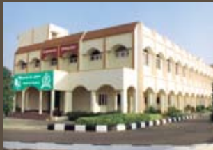
Apollo Hospital & Veg. Dining Block

Languages Offered : French, Thai & Mandarin