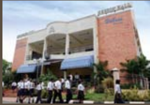
Hebron Hall - Indoor Stadium

Groups in XI & XII : Science, Commerce & Humanities