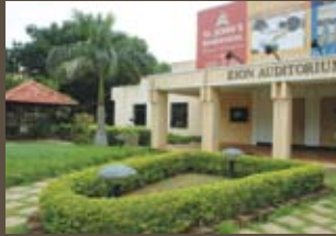
Zion Auditorium - Media Center